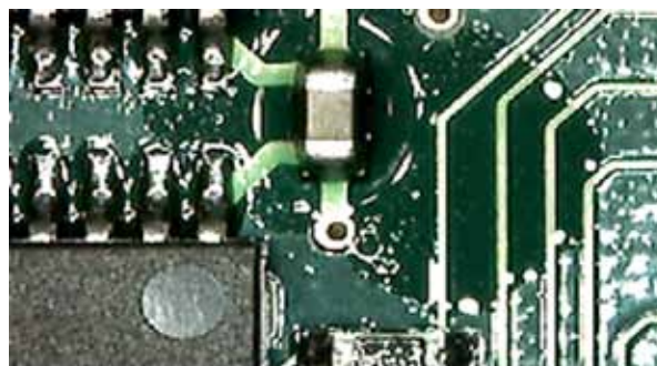
Oil wetting on uncoated PCB

An oil wetting test can also help to identify the Novec 1700 coating on a PCB. Dried films of this coating repel liquids such as mineral oil, paraffin oil and hexadecane. The non-wetting of the mineral oil or paraffin oil on the Novec 1700 coated areas is a simple method for coating verification in the inspection process. (see Figure 3).