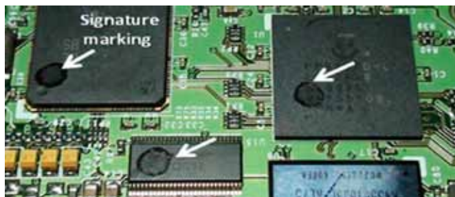
Figure 1. Examples of marking dark components with drops of Novec 1700 coating for identification of coated assemblies

For identification of a coated PCB on the assembly line, small dots of the coating solution can be put on black surface mount components (see Figure 1). The Novec 1700 coating marks on dark surfaces are obvious to the naked eye.