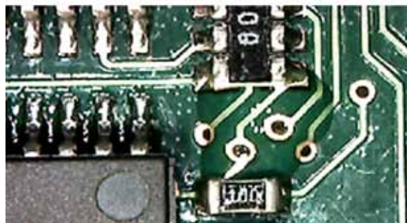
Oil non-wetting on Novec 1700 coated PCB